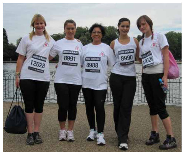
Some of the Team